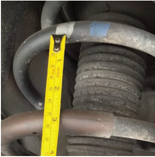
1. Jack up car, measured ~ 2.5" Gap

Rear coil springs : DuraTPE® Plus Series A & BP Ground Lifting Height : ~1"+