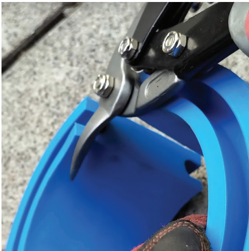
4. Cut off bottom side inner groove for easy insertion