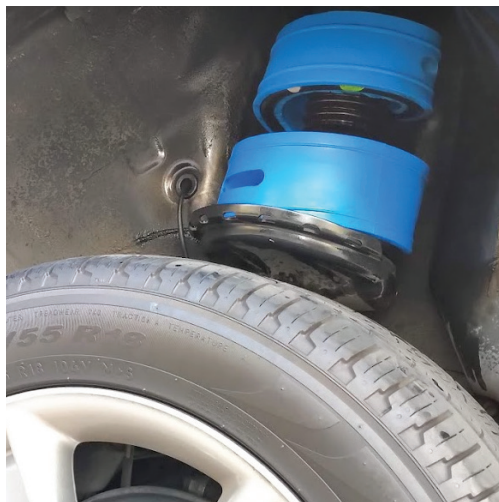
Rear coil springs : DuraTPE Plus A / BP installed