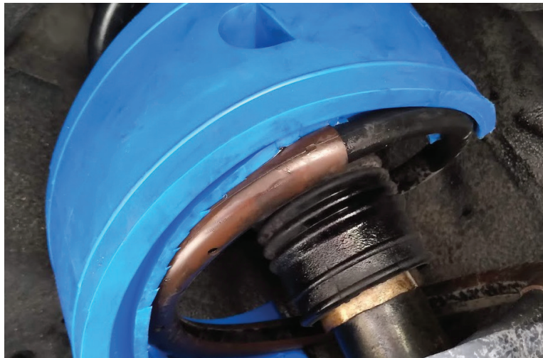
5. Choose the biggest coil gap to begin insert from top groove sit inside groove, then bottom groove pushing in. Make sure top & bottom groove bot sit on coil spring