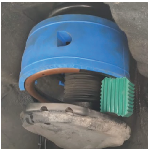
Front coil springs : DuraTPE Plus AP / Rubber Block Booster RB275-2-175 installed