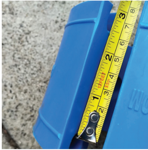
2. Choose A+ , Inner Groove is 2.5", match to Gap 2.5"