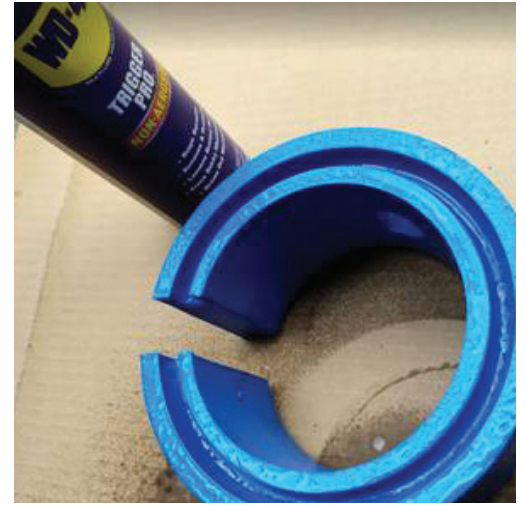
3. Spray lots of WD40 both side for easy install