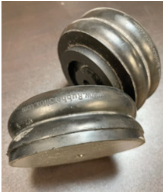
UB1 (Top) +UB2

IMPORTANT NOTICE: RUBBERSHOX INSTALLERS SHOULD APPLY COMMON AUTOMOTIVE SAFETY PRACTICES WHEN RAISING, LOWERING AND WORKING ON VEHICLES, ALWAYS WEARING SAFETY GLASSES, USING BOTH HYDRAULIC JACK AND JACK STAND DURING THE INSTALLATION. We recommend that this installation be done by a professional or person with auto mechanical knowledge. RubberShox Universal Bump Stops are designed to work with original factory springs only. These instructions are general guide line. RubberShox assumes no liability for actual installation process. Rubbershox does not recommend exceed the maximum load recommended by vehicles manufacturer (GVWR)