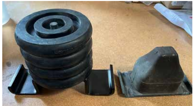
UB1 (Top) +UB2 + Z1-UBS (Bracket) vs. GMC Canyon OE Bump Stop

UB1 (Top) + Z1-UBS (Bracket) Installed for daily driving. Patent pending: modular design bump stop. Add oneUB2 or two UB2(UB3 model equivalent) when towing heavy boat/trailer, prevent rear end dropping and provide more support on load by adding multiple UBS module.