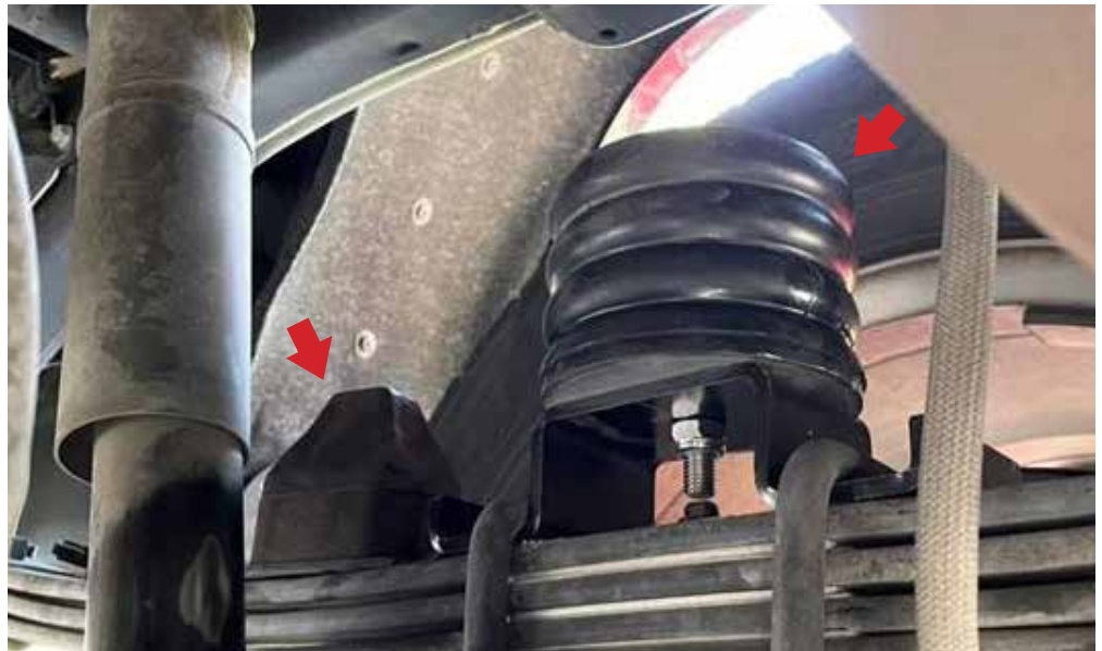
(Left) OE Bump Stop, (Right) RubberShox Model : UB1 (Top) +UB2 + Z1-UBS (Bracket)