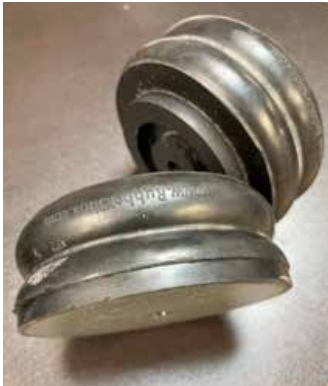
UB1 (Top) +UB2

IMPORTANT NOTICE: RUBBERSHOX INSTALLERS SHOULD APPLY COMMON AUTOMOTIVE SAFETY PRACTICES WHEN RAISING, LOWERING AND WORKING ON VEHICLES, ALWAYS WEARING SAFTY GLASSES, USING BOTH HYDRAULIC JACK AND JACK STAND DURING THE INSTALLATION. We recommend that this installation be done by a professional or person with auto mechanical knowledge. RubberShox Universal Bump Stops are designed to work with original factory springs only. These instructions are general guide line. RubberShox assumes no liability for actual installation process. Rubbershox does not recommend exceed the maximum load recommended by vehicles manufacturer (GVWR)