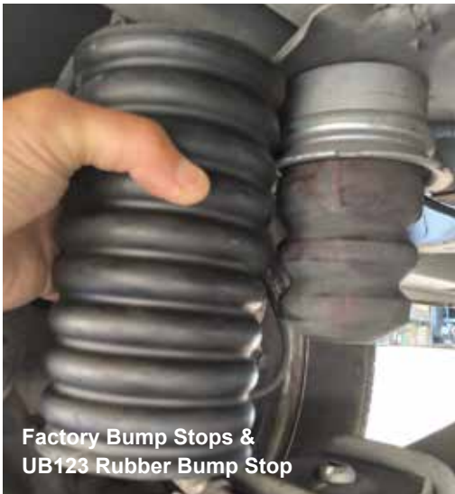
Factory Bump Stops & UB123 Rubber Bump Stop