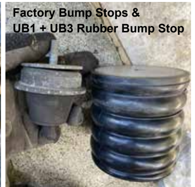
Factory Bump Stops & UB1 + UB3 Rubber Bump Stop