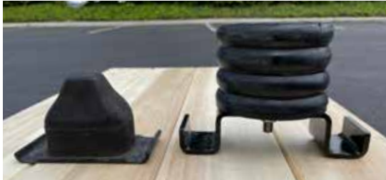
Factory Bump Stops vs. UB12 2019 Chevrolet Colorado