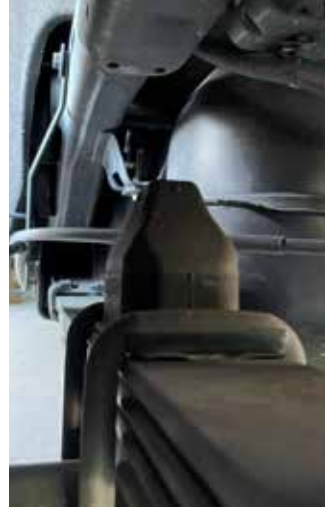
Factory Bump Stops