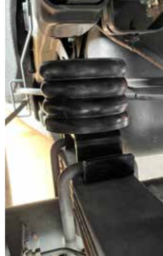
Universal Rubber Bump Stops UB12