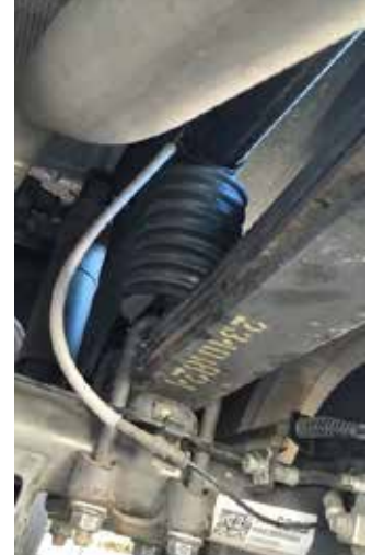
Universal Rubber Bump Stops UB123S